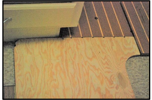
Figure 5 Alignment of New Vinyl Pattern Stripes

could start the difficult orientation of the lines in the vinyl covering (Figure 4). Using the board from the forward port side of the main cabin from the test group (part D4 in Figure 2) as a starting point I aligned the edges of the new adjoining board and carefully marked the location of the vinyl's narrow lines on the test