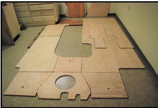
Figure 4 Layout of New Boards for Alignment

Once all the boards were sealed, I laid them out with the boards I had developed in my initial test so that I