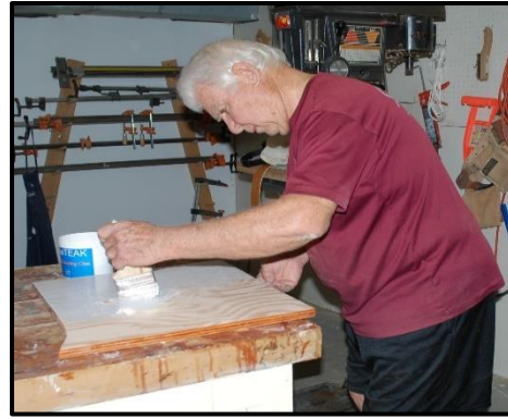
Figure 7 Brushing on the Glue

I found it helpful to not just mark the top of the board but to line markings down the edge of the board so they would be after the glue was applied to the top of the board. The glue says that the glue can be applied with a notched trowel but after with PlasTEAK, I decided to use a disposable short bristle brush to apply the glue (Figure 7). Once the glue is on the board you season for about seven to ten minutes before applying the the brush with water after each gluing application and found it reused. This was a significant savings since I was doing one time and could have gone through 25 brushes. I actually used brushes for the entire project.