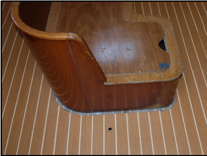
Figure 11 Problem with Old Floor Showing

Once the entire floor was in place, I was dismayed with how the narrow trim of old flooring that had been left under the galley and center console stuck out like a sore thumb (Figure 11). I considered gluing a strip of the vinyl to these edges