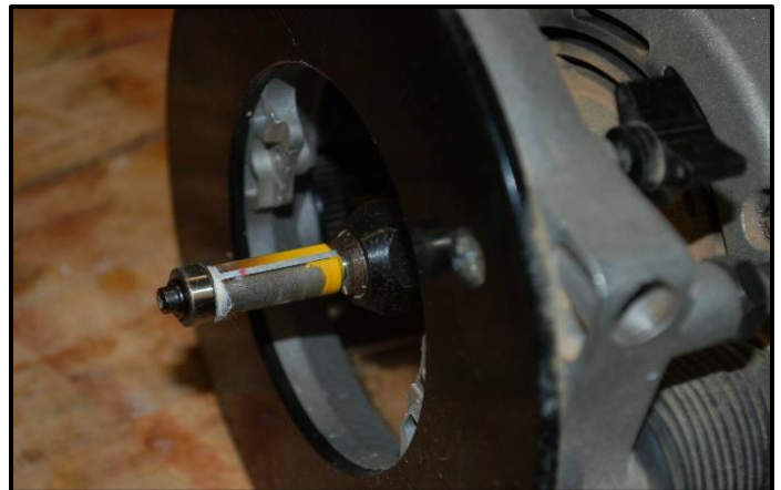
Figure 9 Router Laminate Trim Bit