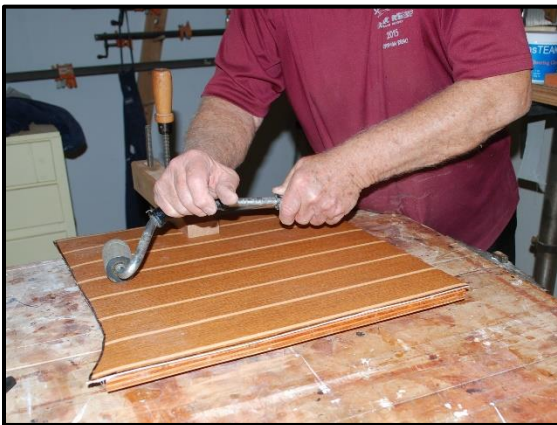
Figure 8 Pressing the Vinyl with Laminate Roller

Once the vinyl is in place, it is important before the glue sets up to apply as much pressure as possible across the entire surface area to ensure a good adhesion. I used a laminate roller to apply the pressure as shown in Figure 8. It was helpful to be able to clamp the piece to the workbench during this operation as the smaller pieces would tend to move when the roller applied the pressure.