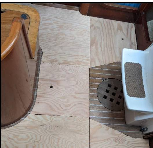
Figure 3 Trial Fit of New Boards

were “M” and the remember piece. calculating draw each drawings of move was able to 2.5” stripe represent