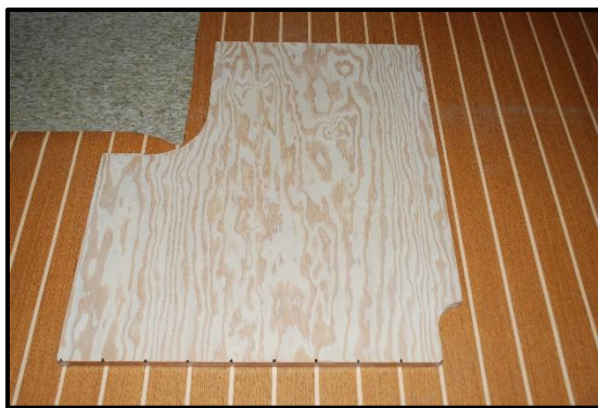
Figure 6 Cutting the Vinyl

board with the adjoining edge of the new board (Figure 5). The marked board was then laid out on the vinyl sheet and the markings were aligned with the lines on the vinyl sheet, being careful to keep the lines parallel to the edge of the board. Then the perimeter of the board was traced onto the vinyl sheet with a marking pen held so that the line drawn was about \frac{1}{4} inch away from the board (Figure 6). I used a permanent marker pen that had a wide felt tip. When I made a mistake, I thought I had ruined a large piece of vinyl, but I discovered that methyl ethyl ketone solvent removed the bad marking without doing any apparent damage to the vinyl.