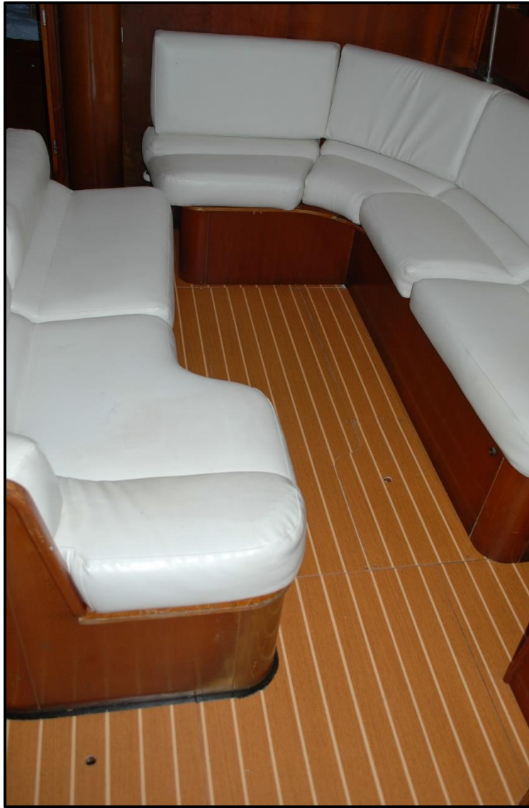
Figure 13 Finished Floor in the Main Cabin

Reflecting on the time for this project, I estimate that about 56 hours were required. About 30% (16 hours) of this time was spent planning the project, 35% (20 hours) cutting and fitting the boards and 35% (20 hours) applying and trimming the vinyl.