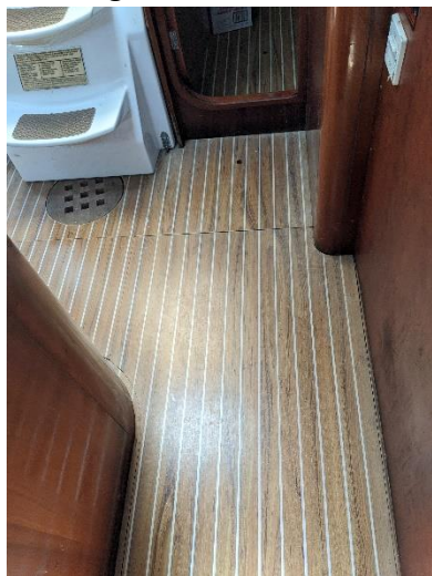
Figure 1 Original Floor

The original floor had a laminate with a teak and holly stripe pattern shown in Figure 1. I was unable to find