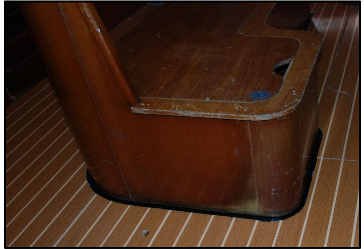
Figure 12 Painted Old Floor

but that would leave a raised trim. However, I was able to mitigate this considerably by sanding the exposed old floor and then painting it with a semigloss black paint (Figure 12). Another option would be to use flexible polyurethane quarter round, but this would require nailing or gluing it to the flooring or cabinetry and I did not want to do this.